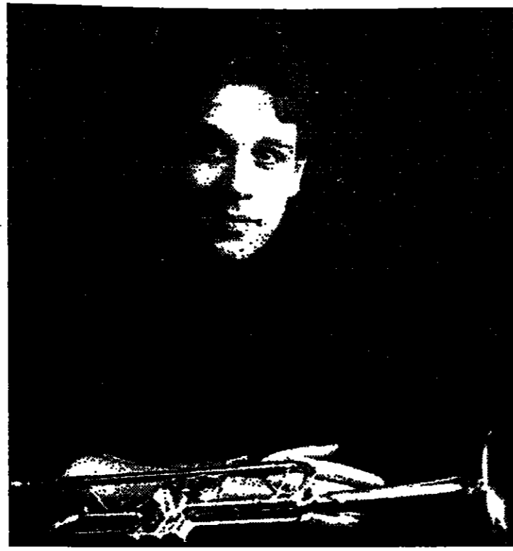
Trumpeter Hakan Hardenberger performs tonight and tomorrow at the Henry Crown Symphony Hall.